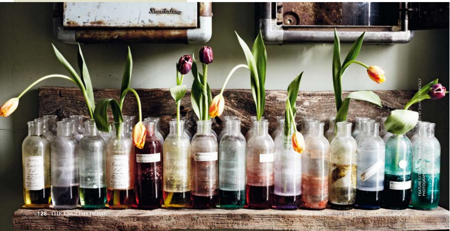
FEATURE EXTRACTED FROM A YEAR IN FLOWERS BY SHANE CONNOLLY

Garden flowers especially seem to have a natural affinity with jugs. COLOURED GLASS can completely increase the intensity of flowers and foliage alike. Turquoise glass in particular, flatters any flower. BOWLS LARGE AND SMALL are great for floating or heaping together broken off flower heads. Fruit too. QUIRKY CONTAINERS like a Buddha foot or pewter inkwell are just a bit of fun. They do hold flowers wonderfully but also remind us not to take it all too seriously. ■